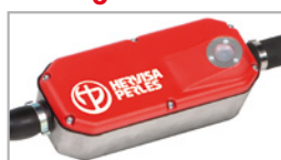
Runner plus 65-75 (2,2 CV)